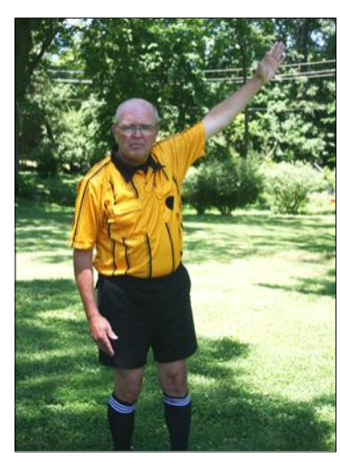
Corner Kick Point to corner area where kick will be taken