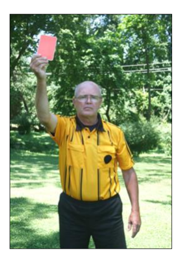
Red Card Expulsion